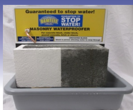
Latex + MC Powder English #11000A (quantity) _____