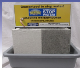
Max Cover Powder Only English #11000C (quantity) _____