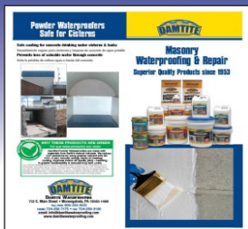
Cisterns Photo on Back # 11102 (quantity) _____ 50 units / pack