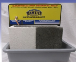
Latex + MC Powder Spanish #11000B (quantity) _____