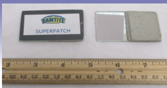
SuperPatch Mirror - Concrete Color #11902 (quantity) _____