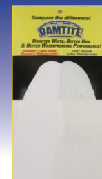
Latex Drawdown #11301 (quantity) _____