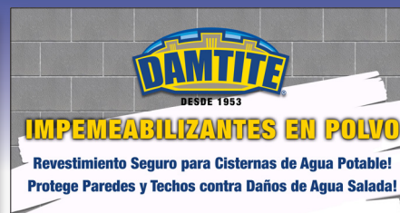
Spanish Cisterns #11252 (quantity) _____