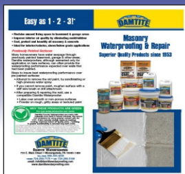
Easy as 1-2-3 Photo on Back # 11101 (quantity) _____ 50 units / pack