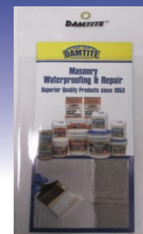
Plastic Handout Holder #11150 (quantity) _____