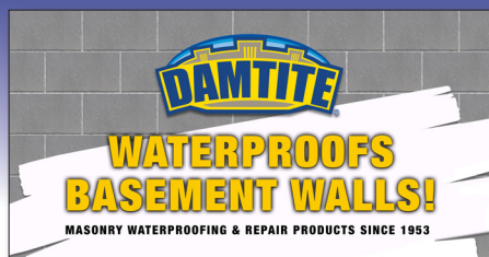
English Basement #11250 (quantity) _____