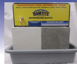
Max Cover Powder Only Spanish #11000D (quantity) _____