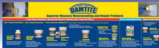
3' Display Header #11200 (quantity) _____