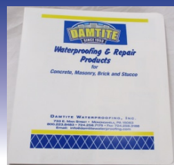
3 Ring Product Binder #11901 (quantity) _____